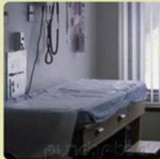
Stimulus 1 Doctor's office